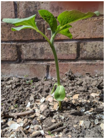
Day 4 17cm