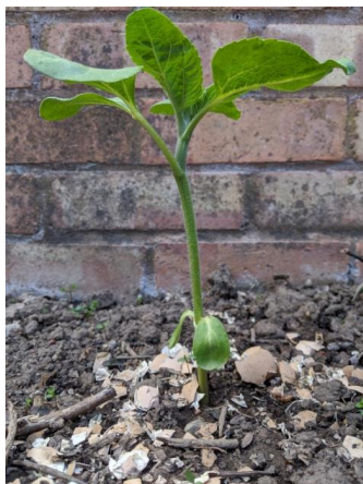
Day 5 17.5cm