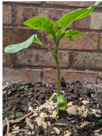
Day 6 18.5cm