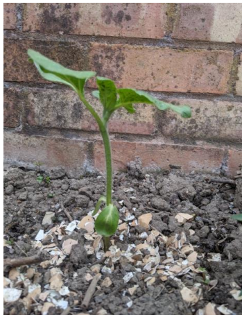
Day 2 16cm