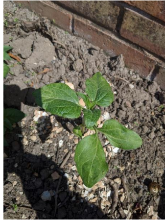
Day 3 16cm new leaf