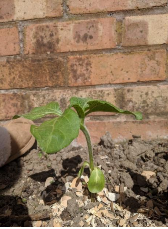
Day 1 14cm