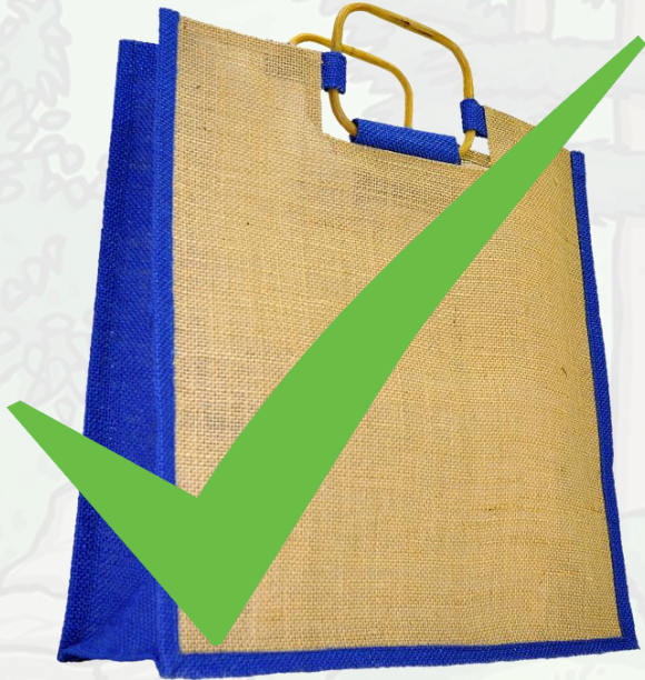
Photo courtesy of ( @pixabay.com ) - granted under creative commons licence - attribution

Look at these two pictures. Which do you think is the right bag to use, to help the environment?