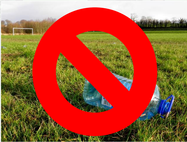
Photo courtesy of (@geograph.ie) - granted under creative commons licence - attribution

Look at these two pictures. Which do you think is the right to do, to help the environment?