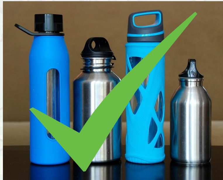
Photo courtesy of (@pixabay.com) - granted under creative commons licence - attribution

Photo courtesy of (@Wikipedia.org) - granted under creative commons licence - attribution