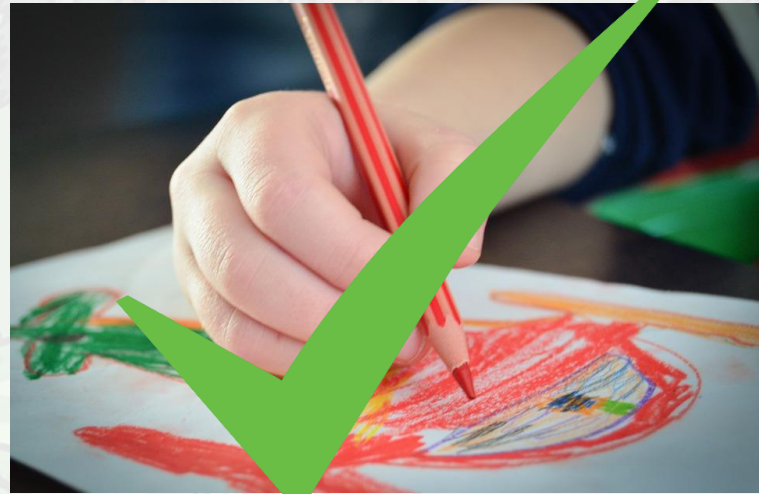
Photo courtesy of ( @pixabay.com ) - granted under creative commons licence - attribution

Photo courtesy of ( @commons.wikimedia.org ) - granted under creative commons licence - attribution