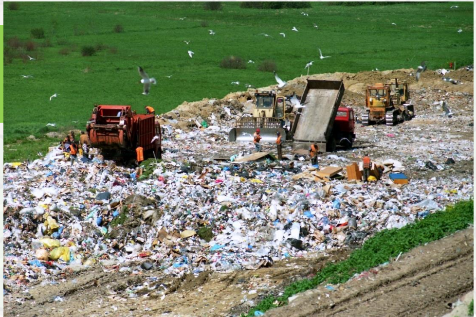
Photo courtesy of ( @Wikimedia.org ) - granted under creative commons licence - attribution

It is usually buried in huge landfill sites . This means we don't see it, but it is still there and can last for many hundreds of years.