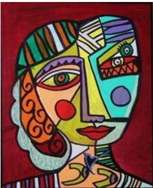
Portrait created by Pablo Picasso

Here are some different styles of Portraits: