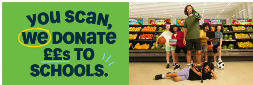
CASHPOT FOR SCHOOLS - ASDA GROCERIES

The Christmas raffle is one of our biggest fundraising opportunities of the year, so please don't forget to return your money and stubs to the School office asap to be in with a chance of winning. We are gathering a good selection of prizes but are in need of some (full!) wine bottles, luxury gifts and foods, plus some smaller items for our Tombola. If you could help or donate in any way, this would be great! Thank you.